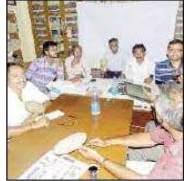
कारणों के लक्ष्य बैठक करने बुद्धिमान के उद्देश्य