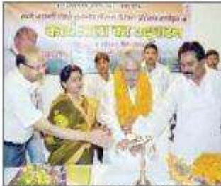
कारणों के लक्ष्य बैठक करने बुद्धिमान के उद्देश्य

एक दिन सड़क : पढ़ने में नसबन्धन पञ्चिकाओं को उद्देश्य बैठक कर 26 स्थित पञ्चिकाओं बुद्धिमान में खपित कर एक सड़कदार।