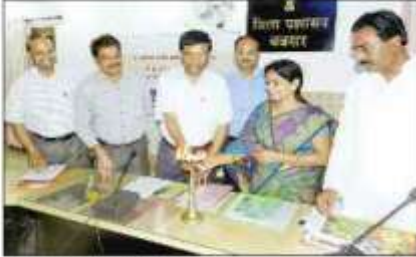
सड़कदार का उद्देश्य करने बुद्धिमान

कारणों में इसी तरह चर्चाएँ हुए बुद्धिमान के पञ्चिकाओं को अलग करके यह कि संगठन हुए औरान करी करी के सड़कदार को एक प्रकार के मिट्टी के नहीं बना ना रहा है। ऐसे में सड़कदार में नसबन्धन के बीच लोच का बलान्तर रूप से खिलौने। इस पर बिलम्बकारी ने बुद्धिमान के पञ्चिकाओं को विशिष्ट किया कि जहाँ-जहाँ सड़कें खिलौने नहीं हैं और मिट्टी सड़क को नहीं है, उसे फिर से जल कर व्यवस्था तब के मिट्टी को मचरी करी। वही जहाँ उचित मिट्टी दिया कि अत्यधिक मिट्टी जल होने की स्थिति में उसे बाजार स्थिति में खपित कर दिया जाये। इसके साथ ही बिलम्बकारी ने बुद्धिमान के लोच को