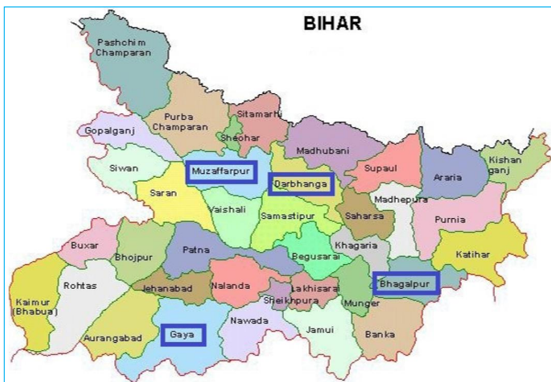
Figure 1: Location of project towns